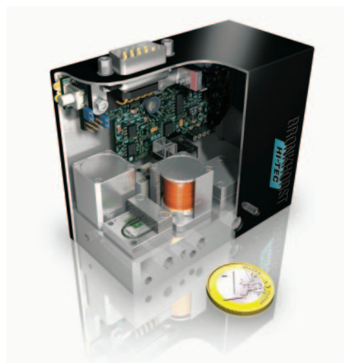
EXAMPLE OF CUSTOMISED MANIFOLD SOLUTION with Flow / Pressure Control