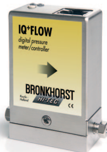
IQP-700 PRESSURE CONTROLLER (Picture scale 1 : 1)