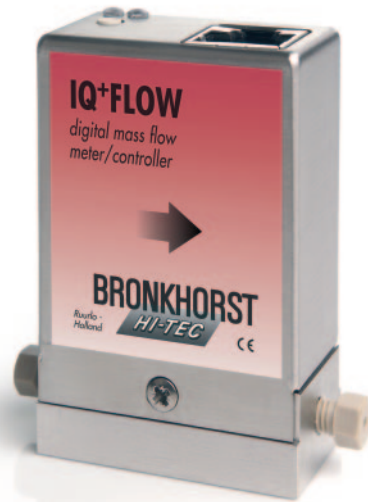
IQF-200 MASS FLOW CONTROLLER (Picture scale 1 : 1)